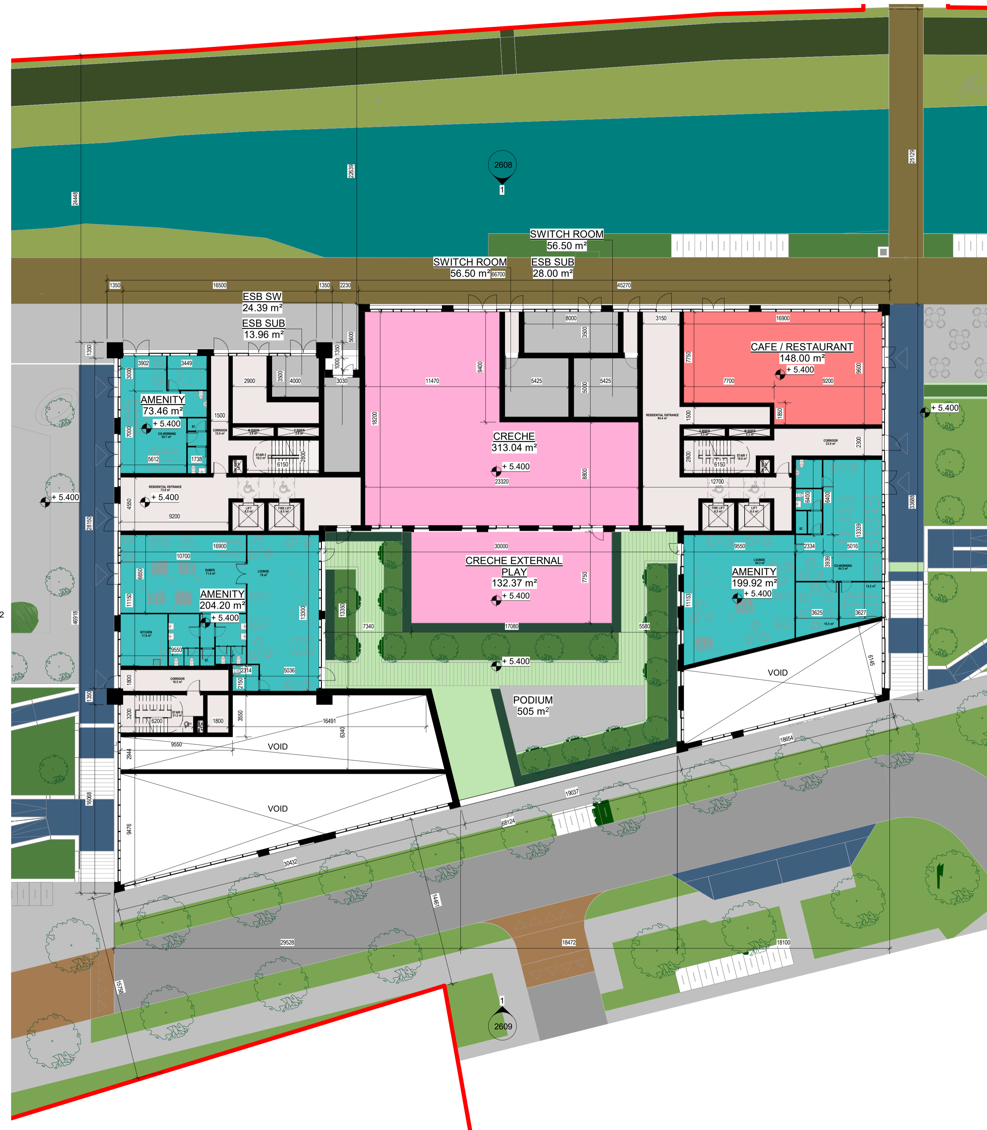
1 PLAN - BLOCK D - LEVEL 00 1:200

Please consider the environment before printing this sheet